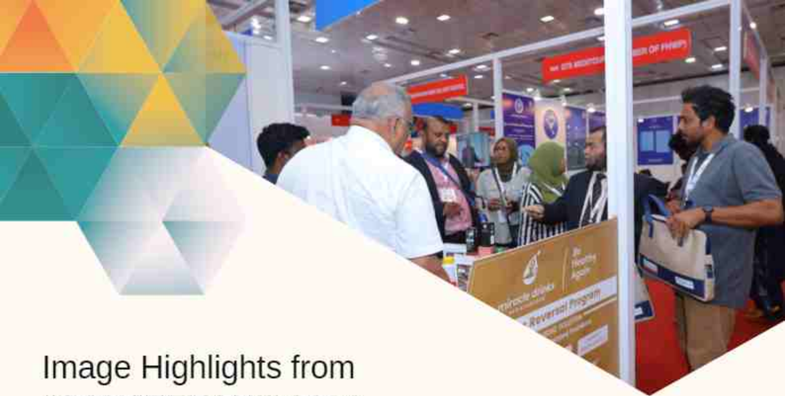
Image Highlights from “SANJEEVANI” 2024