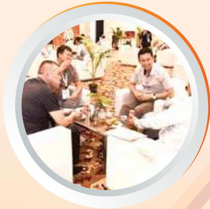
B2B sector presentation and roundtable meetings