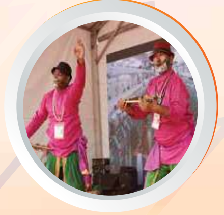
Cultural Performances (Folk & Classical)