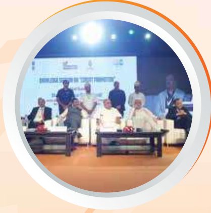
Knowledge Sessions, Seminars, Conclaves