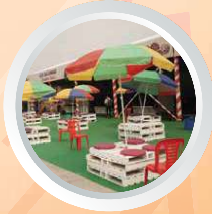
UP Ka Swad (Cuisine and Culinary Arts)