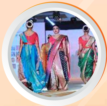
Fashion Shows and Band Performances